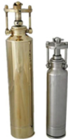
IWIN-AS500 / AS1000