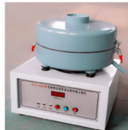
IWIN-ACE15 / 30 / 40