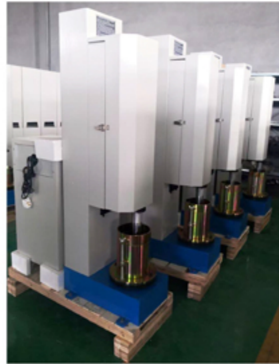
IWIN-ASC01 / ASC02 Integrated / Split