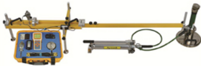
IWIN-Ev2 / WEv2