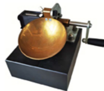
IWIN-LLCA / ELLCA