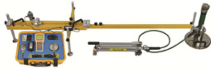
IWIN-K30 / WK30