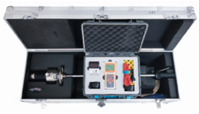
IWIN-Evd / WEvd