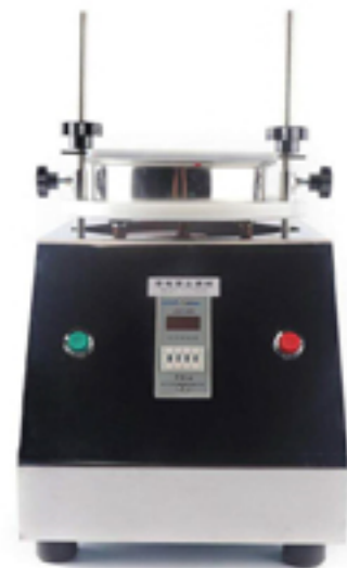
IWIN-SS20 / SS30 / SS40